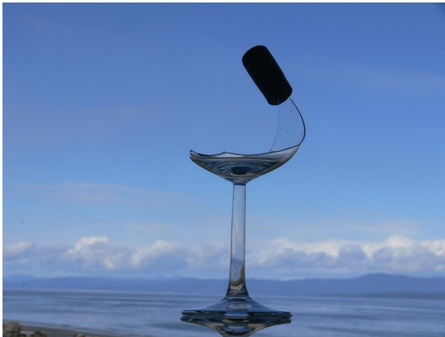
Glass - "Cheers!" - Robin Pearson