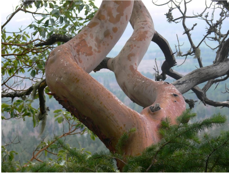
Little Mountain - "Curves Ahead" - Robin Pearson